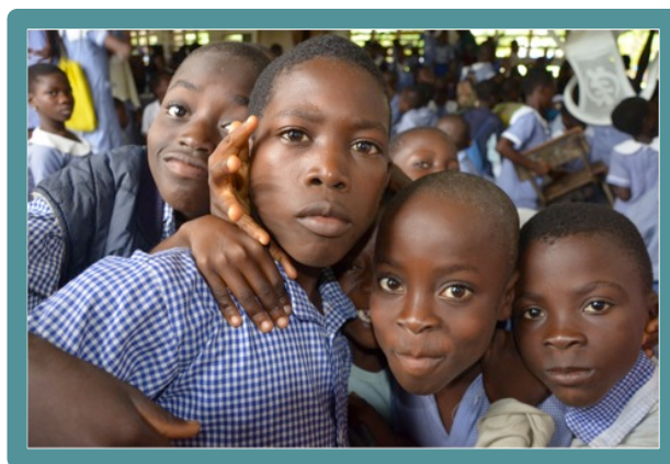
Pupils in University Practice Primary school who participated in a school based sensitization events in their school.