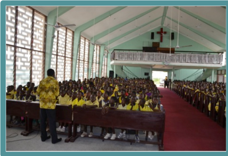
Top: Over 300 pupils in Methodist Primary and Junior High School in Winneba who participated in the schools based sensitization.