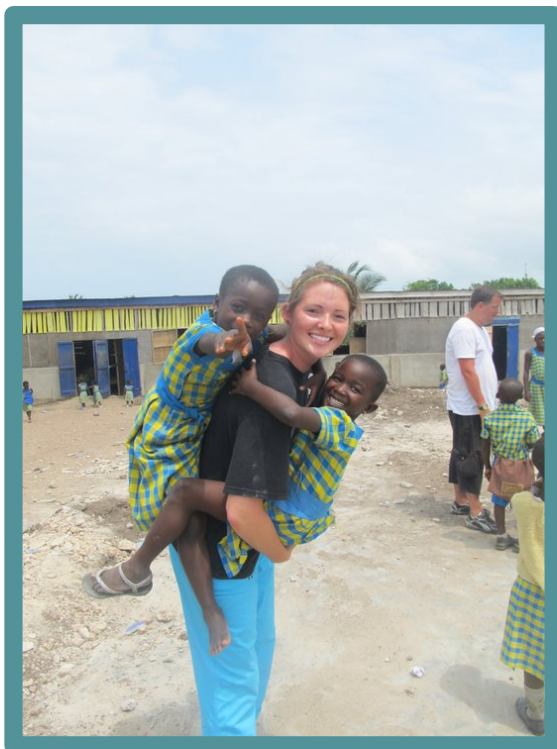
2 of our volunteers that joined the team in 2011

We greatly appreciate the support of our volunteers to come to Ghana to work with us as well as those that continue to support us from abroad. Our volunteers are an integral part of our work and their support is invaluable. We would like to therefore officially recognize and sincerely thank all of our volunteers for their generous time and contribution throughout the year.