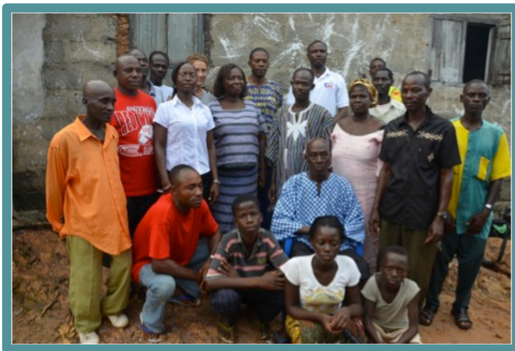
Community Child Protection Committee (CCPC) members in Agya Community in Senya.