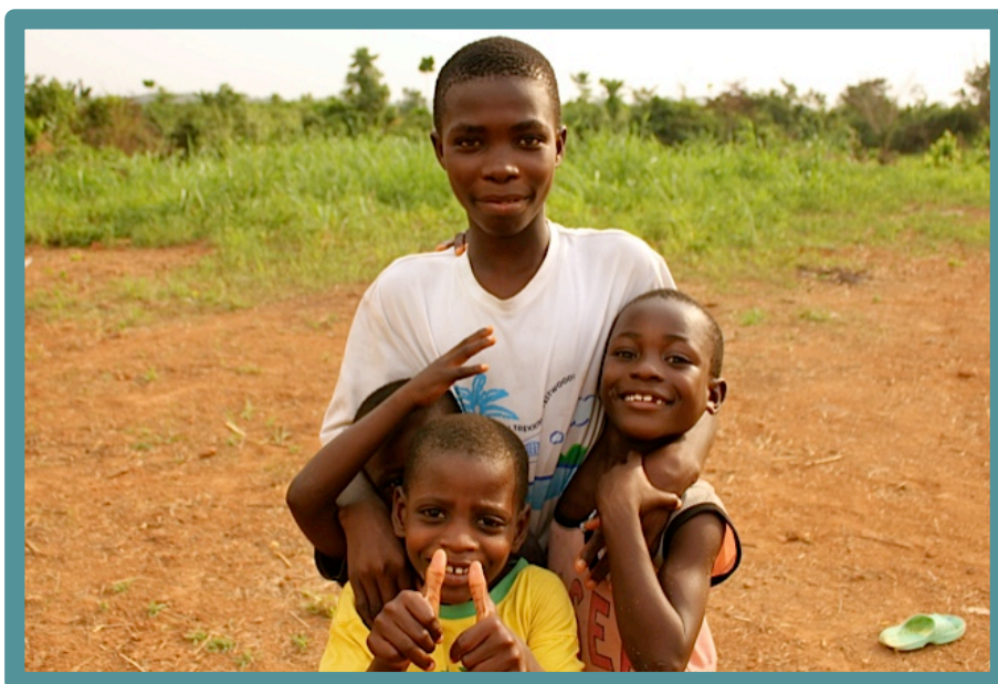
Young children playing outside at the CH Hovde House