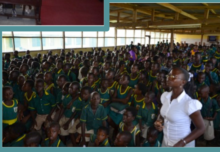
Right: Over 300 pupils in Zion A/B Primary and Junior High School in Winneba who participated in the school based sensitization event in their school.

Despite the dangers associated with our work, our advocacy and community sensitization efforts are proving to be fruitful. During the year we continued to deliver the message of child trafficking/ slavery, child labor and worst forms of child labor into schools, religious institutions, markets and communities. The events were carried through community durbars (formal gatherings), film shows and sports programs. 8 community – based durbars were organized in 8 fishing and farming communities in Effutu Municipality and Awutu Senya District. In these events 2,500 people were reached through this programs 15 school based, 10 faith – based, 5 market based and 15 general community – based sensitization events were organized. Over 21,234 people were reached with the anti – slavery message in 40 program communities.