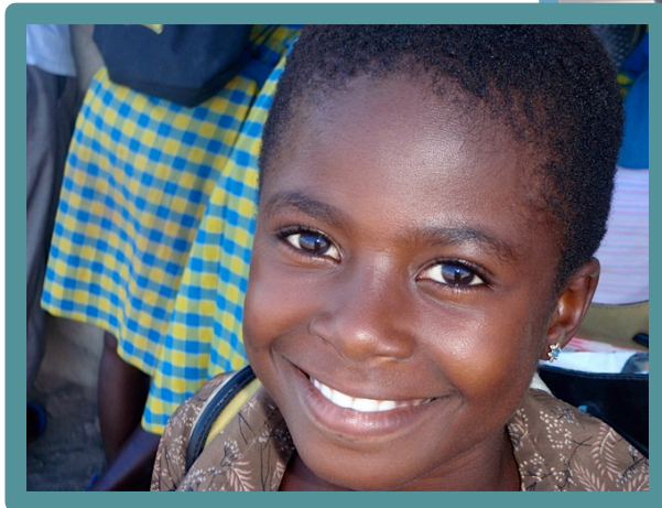
Bottom and right: Children at the Challenging Heights School Community Center